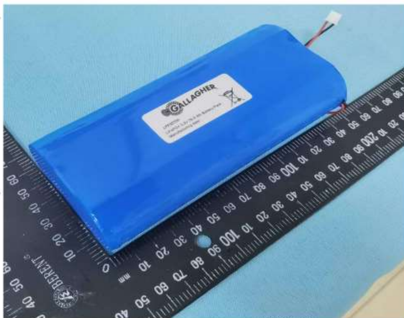
Figure 1 Overall view I of battery (电池外观图I)