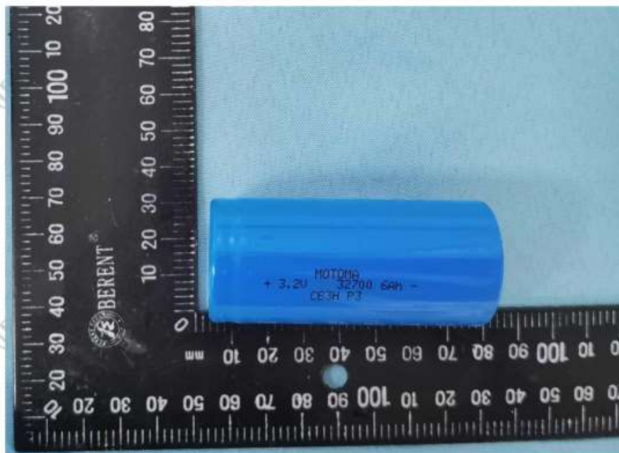
Figure 3 Overall view of cell (电芯外观图)