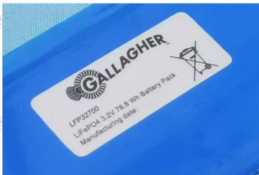
Figure 4 Overall view of label (标签图)