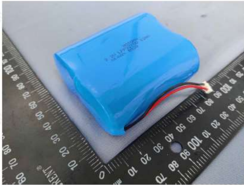
Figure 1 Overall view I of battery (外观图I)