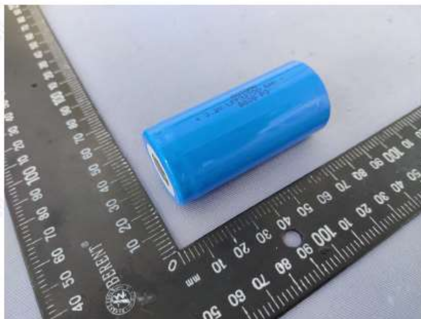
Figure 3 Overall view of cell (电芯图)